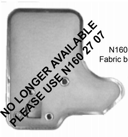
N160 27 03 Fabric both sides