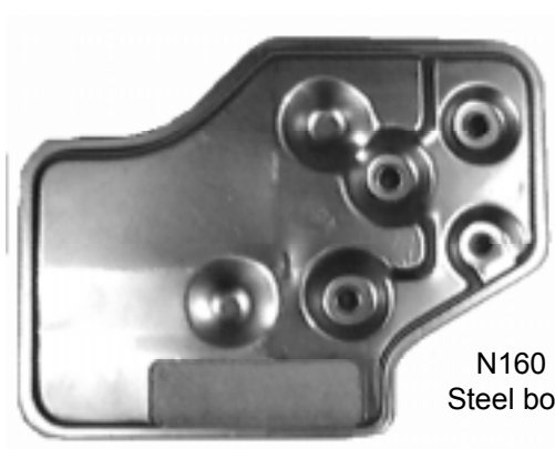
N160 27 05 Steel both sides