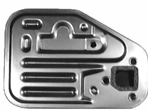
N160 27 07 Steel side showing - underside is plastic