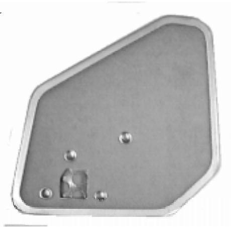
N160 27 02 Fabric both sides