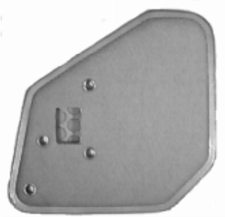
N160 27 01 Fabric both sides